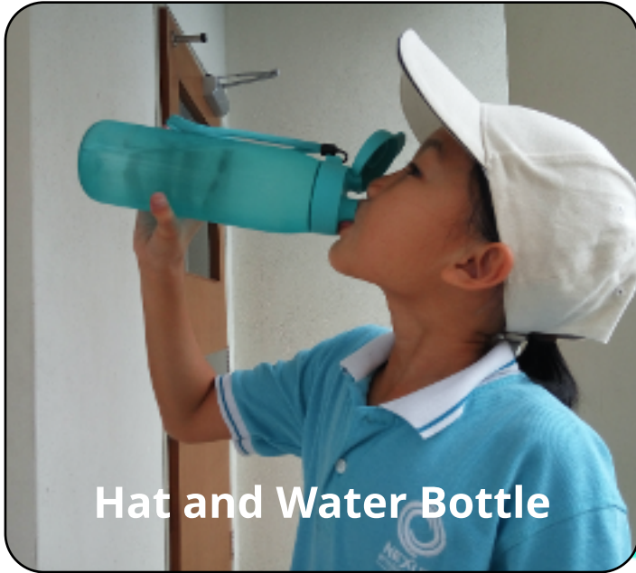
Hat and Water Bottle