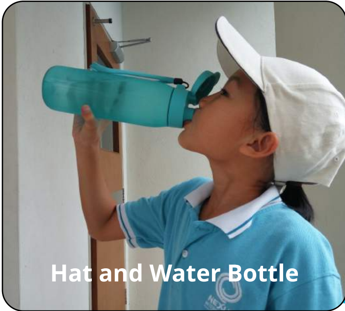
Hat and Water Bottle