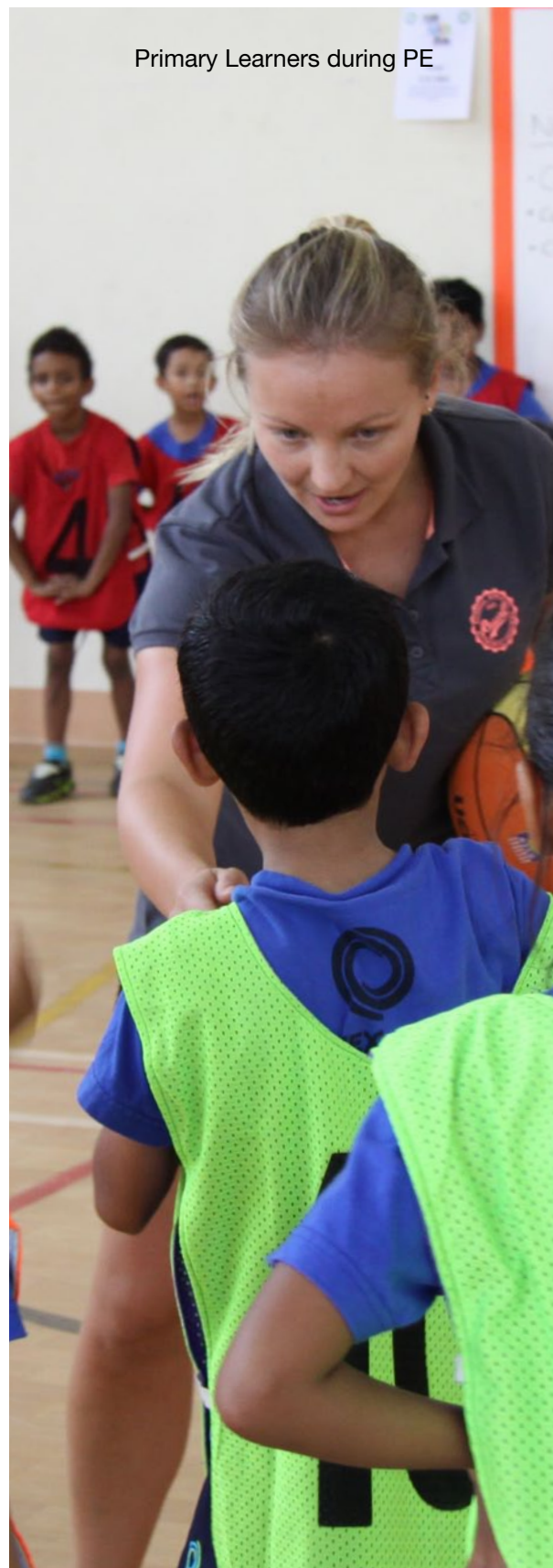
Primary Learners during PE

If you have any questions or queries relating to CCA matters please contact the CCA coordinator at cca.enquiry@nexus.edu.my