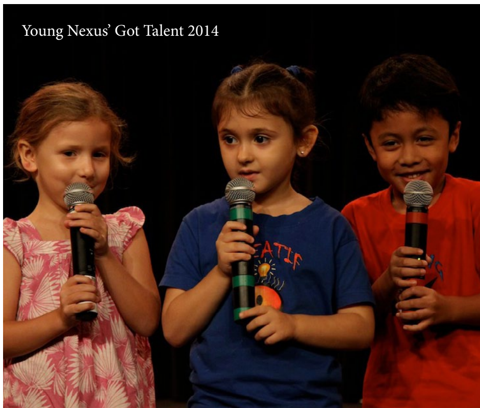
Young Nexus' Got Talent 2014

By taking the learners out of the classroom we aim to provide a first hand language learning experience for them.