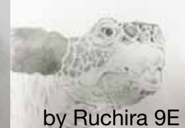
by Ruchira 9E