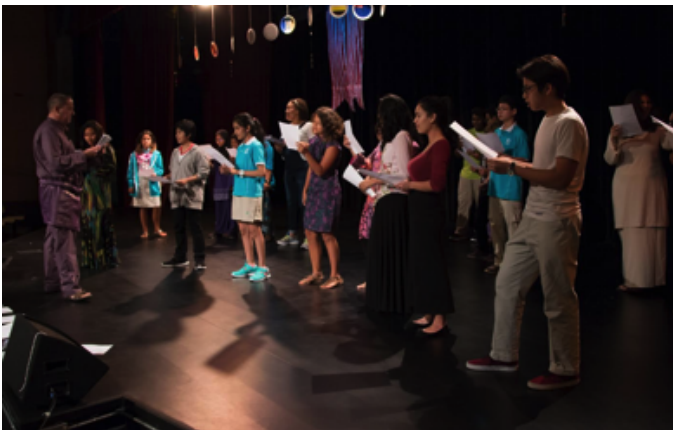
Whole Cast Vocal Training