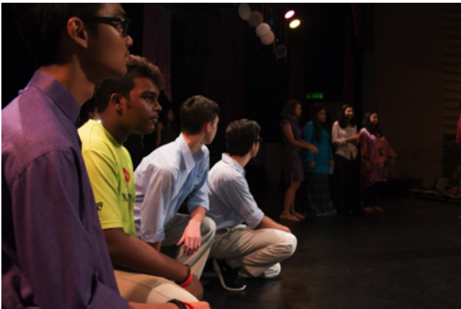
The T-Birds and the Pink Ladies