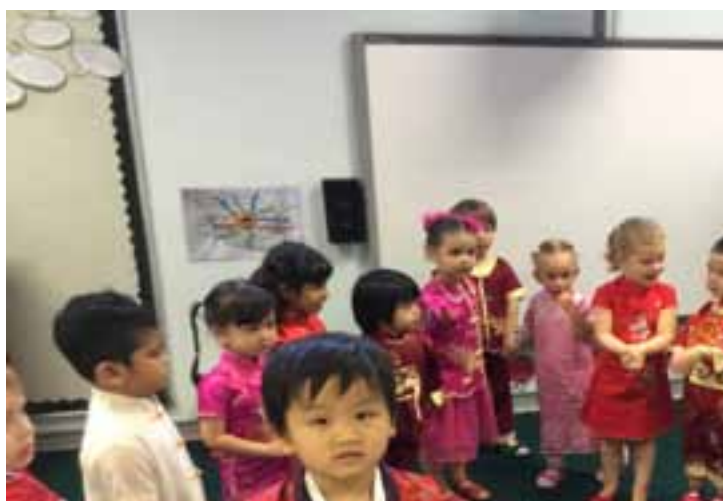
Learners saying "Gong Xi Fa Cai,"