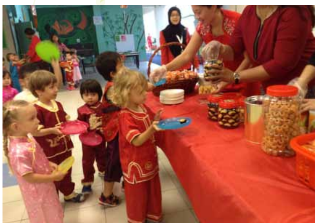
Learner tasting Chinese snacks.

Chinese lunar year celebrations gave Early Years learners the opportunities to celebrate cultural diversities and commonalities.