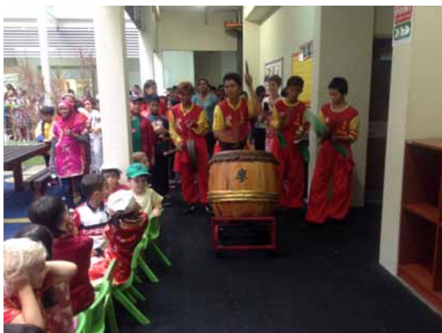
Lion dance drummers – "It is so loud!" the learner said.