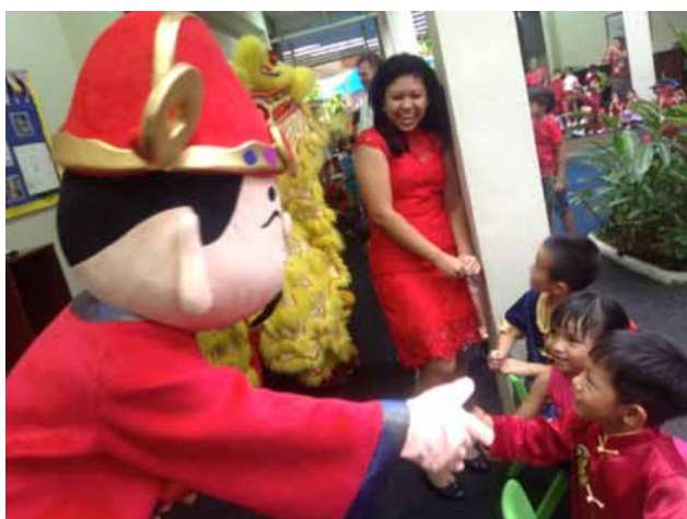
God of prosperity.