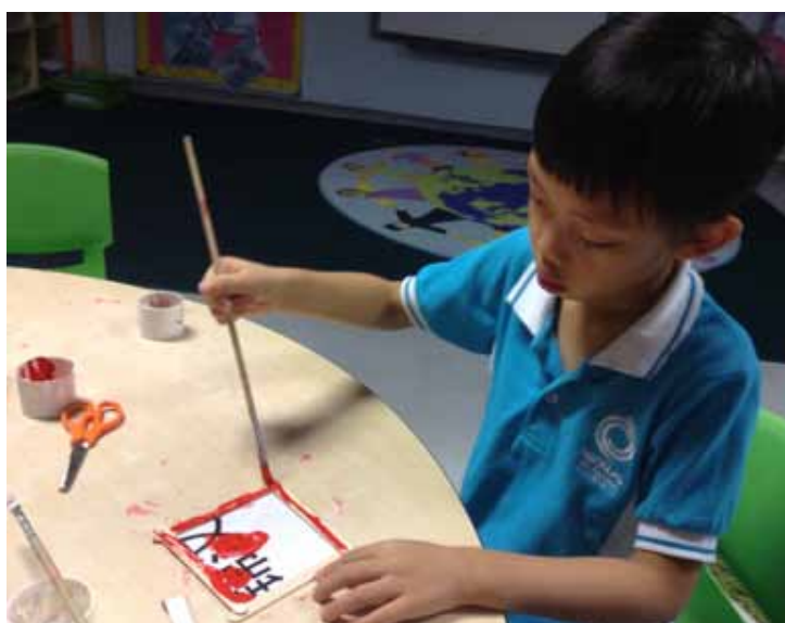
Learners wrote their names using Chinese characters.