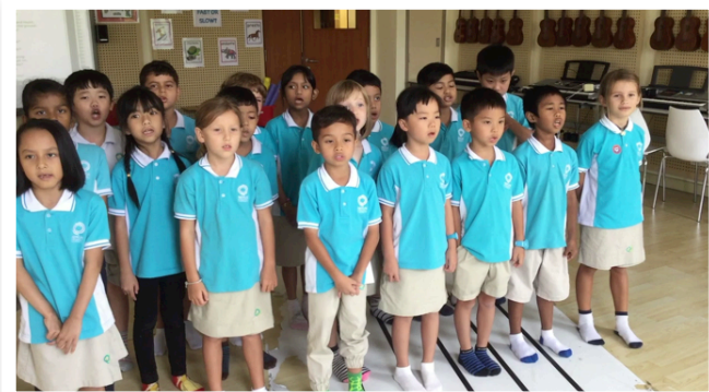
2E Rehearsing 'How Do You Get to School?'