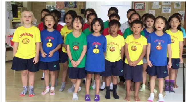
2N Rehearsing 'How Do You Travel?'