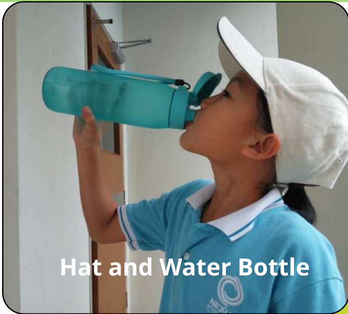
Hat and Water Bottle

Bring your Home Learning/ Reading folder